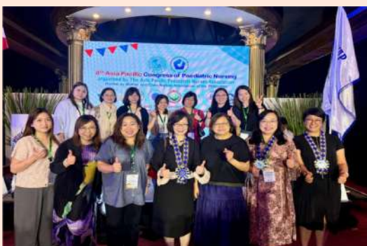
Group photo of Hong Kong Paediatric Nurses and invited speakers.