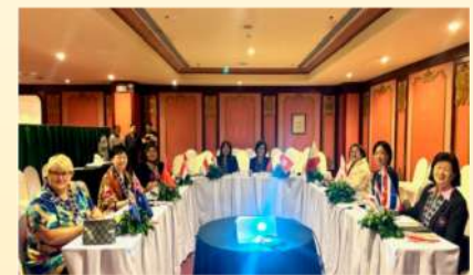
APPNA Council Meeting on 16 Nov 2024