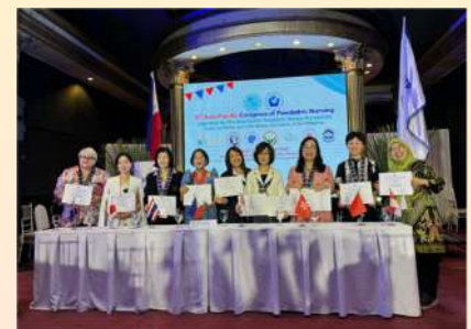
APPNA Council representatives from 8 countries/ areas